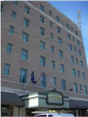
Hawthorn Suites Hotel